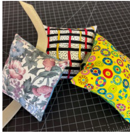
Lemon print fabric is cut and ready for making into port pillows.