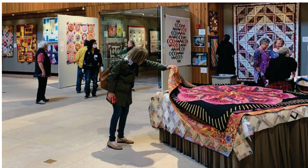
Where was the White Glove volunteer to assist this visitor?