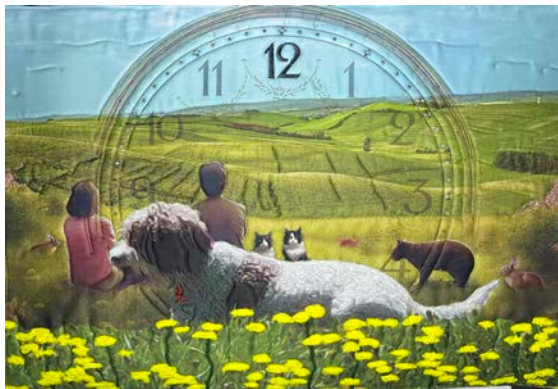
A Place Where the Energy of the Sun Radiates