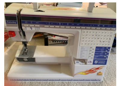
Viking Husqvarna +1