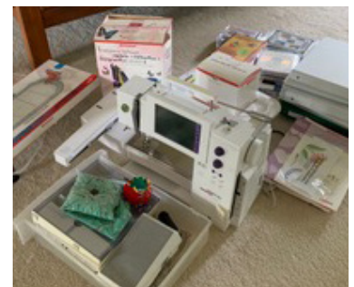
Bernina's Artista 200E shown with many accessories