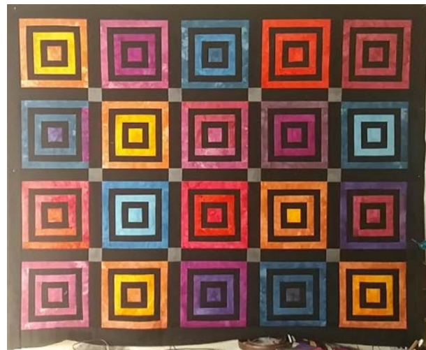
The blue one is one of my first quilts, hand and machine quilted – where I got my hand sewing mojo. The second one is currently being hand quilted, original design, modified from a vintage amish quilt, using my hand-dyed fabrics.