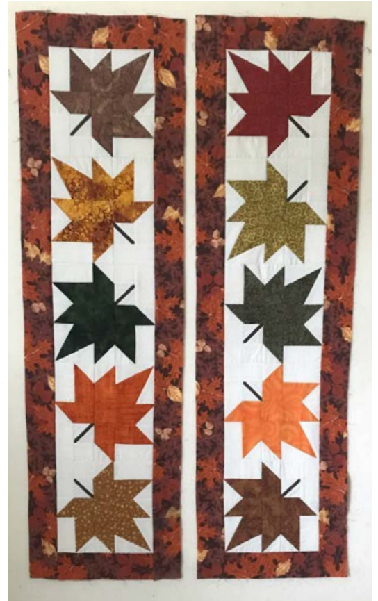
The table runners are an adaptation of a pattern from Cut Loose Press. The turkey and chicken bread baskets are from a pattern called Handy Baskets by Cotton Ginnys. Examples of charity quilts at left.