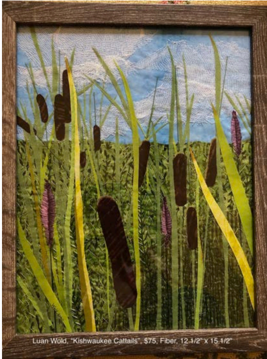
Luan Wold, "Kishwaukee Cattails", $75, Fiber, 12 1/2" x 15 1/2"