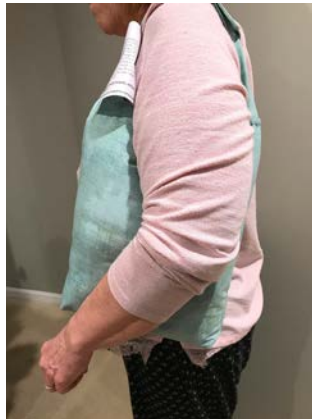
The Anti-Ouch Pouch is a pillow that hangs from the shoulder, fitting snugly under the arm to cushion the area after breast surgery or radiation treatments.