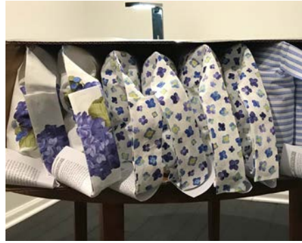
Anti-Ouch Pouches before filling (left) and completed above. They are easy to make and provide welcome relief.