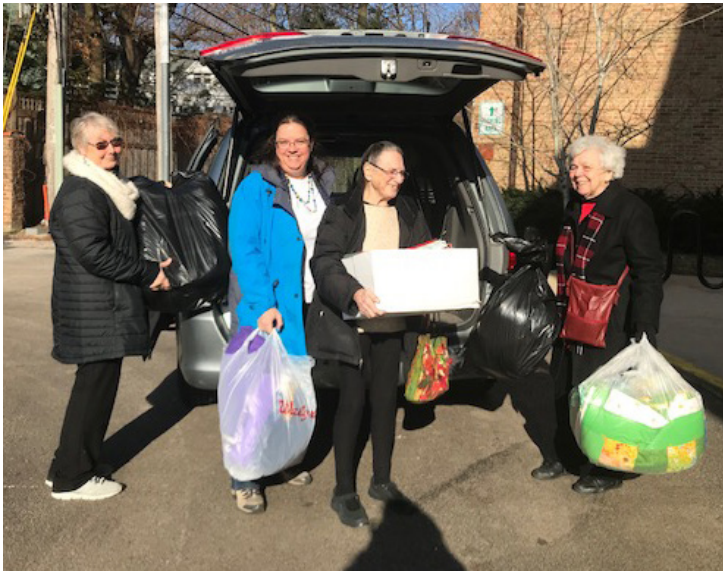
NSNG service group delivered blankets and pillowcases to the Evanston YWCA in December.