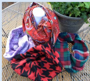
Bring a half-yard of polar fleece or light weight fabric to make an infinity scarf at the January 14 mini workshop.