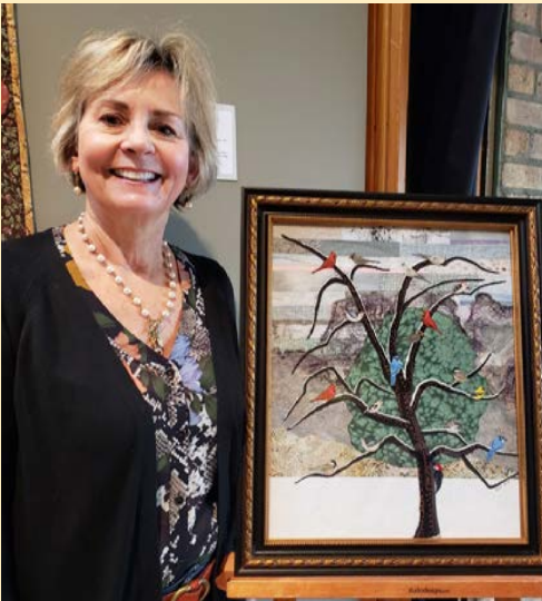
The tree in her rural backyard inspired The Bird Tree by Luan Wold.