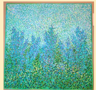
3rd PLACE: Garden Blues by Pat Kroth