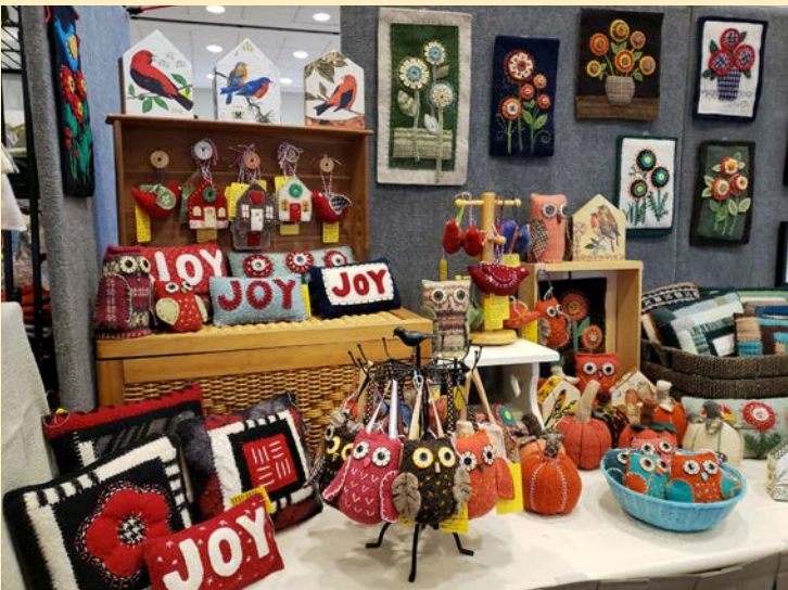
Jan Harrington stitches owls, birds, wall hangings and pillows out of upcycled wool sweaters, scarves and other textiles.