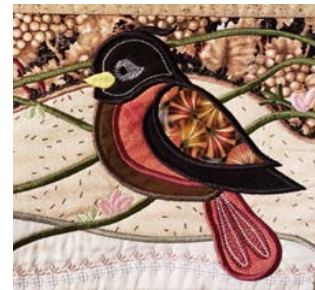
Kookaburra Sits in the Old Gum Tree by Kristin Woods