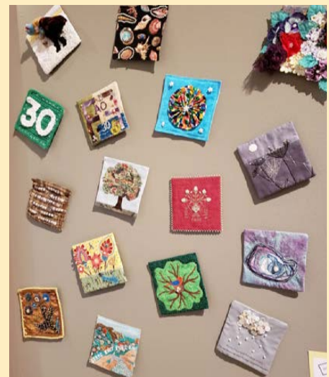
Garden Pearls Challenge. Sixteen members made small fiber art pieces to celebrate the 30th year of the combined Guilds participation in the show.